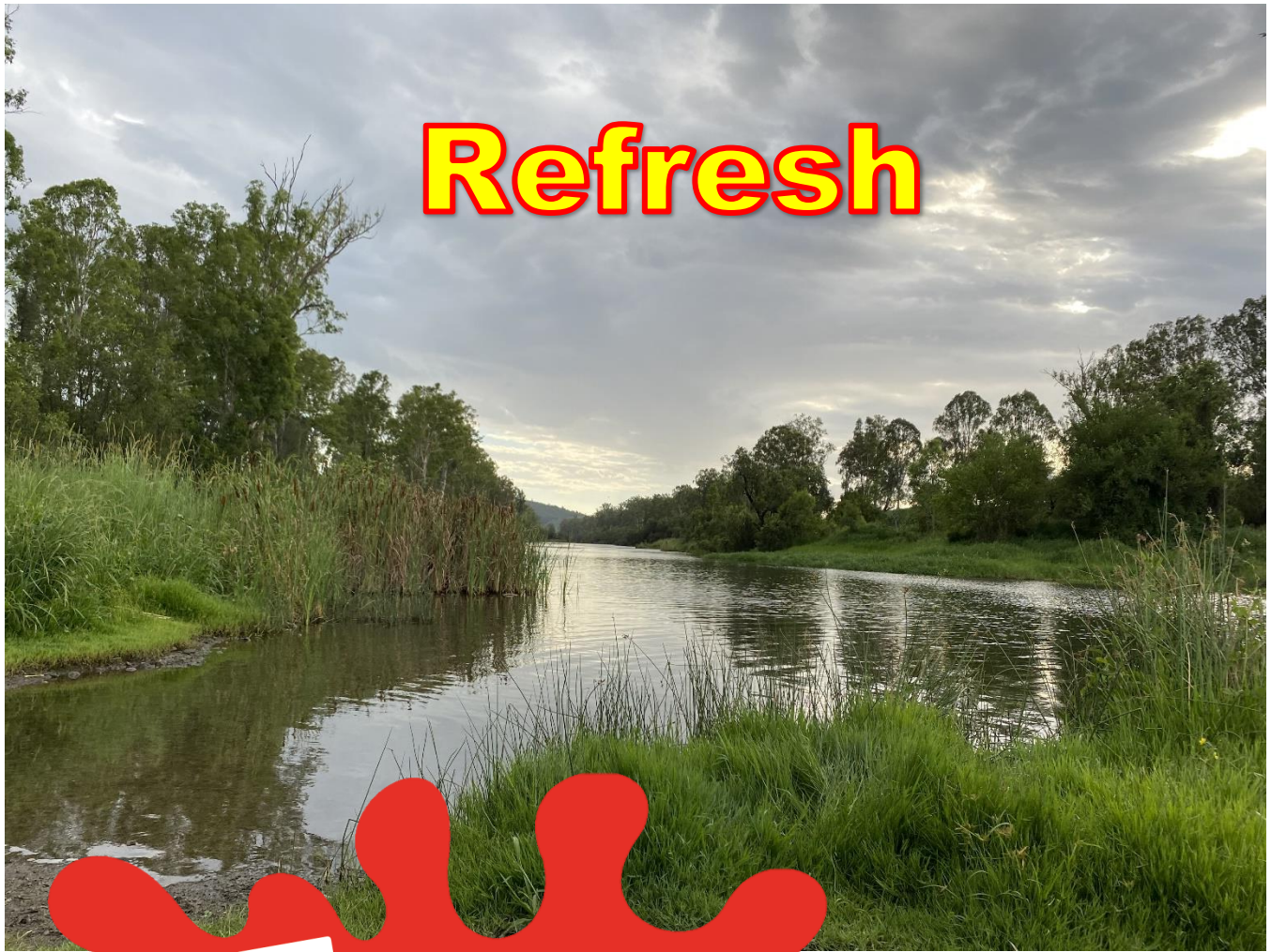
Brisbane River – Savage's Crossing